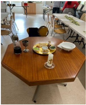
Sedar plate in centre of table